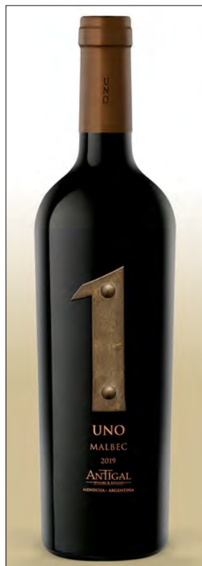
ANTIGAL WINERY & ESTATES Malbec Men-doza Uno 2019 (90, $15) BEST VALUE Fresh, firm; brambly blackberry, violet, thyme, mineral

BODEGAS CARCHELO Jumilla C 2018 (89, $15) Balanced; dried cherry, sandalwood, olive, smoke